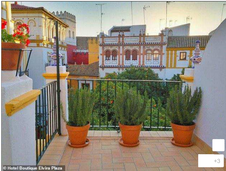
© Hotel Boutique Elvira Plaza Seville oranges: A terrace at the Hotel Boutique Elvira Plaza, Seville (above), which is on a lovely square with orange trees and birdsong in the heart of the central Santa Cruz district

On a lovely square with orange trees and birdsong in the heart of the central Santa Cruz district, Elvira Plaza is a design hotel. Rooms are whitewashed, with bright tiles in bathrooms adding some colour — perfect crashpads for a weekend. There's an expensive see-and-be-seen restaurant, but there are plenty of tapas bars nearby.