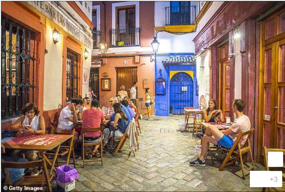
Food for thought: Bar las Teresas, above, is a tapas bar close to Alcazar

Another superb tapas bar, close to the Alcazar. Hams hang from the ceiling, pictures of flamenco dancers adorn the walls and waiters squeeze through the throng, balancing trays of delicious little pork-and-potato stews, olives, sliced hams and drinks. It's £1.60 for a glass of wine. Tapas dishes are £2.30. For organised tapas tours, try devoursevillefoodtours.com . 2 Calle Santa Teresa