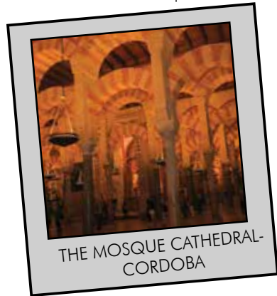
THE MOSQUE CATHEDRAL- CORDOBA

Bye! Bye! Mumbai. All of us gathered at the airport patiently anticipating what's going to take place next. As we checked in for our flight at 5am with heavy eyes, we introduced ourselves to each other. You definitely don't want to guess what happens when majority of the travel writers who are females meet up for a FAM. Flying via Turkish Airlines has been the best experience ever. The cheese platter on flight was incredible. Having a break journey at Istanbul was all we needed. As we walked up to the Turkish Airlines Lounge, the sight was so pleasing. The whole lounge so beautifully decorated with antique chandeliers and has altogether different themes in each and every section. The food was mouth watering and the Turkish coffee (which I was craving for) stole the show. Taking a 2pm flight from Istanbul to Madrid, obviously via Turkish Airlines again and experiencing authentic Turkish food on flight was a superb experience. What more can one ask for? At the Madrid, Barajas airport, we took a mini bus to the Ayre Gran Colón Hotel. One of the most luxurious properties in the city and why not, after all it's owned by the Palladium group of hotels. Ok, so now the trip had started and we reached our first dinner place Le Platea. Heaven of a place! It's like a small food mall with different types of cuisines on every floor and a stage where one could have live performances. Caught up on a sexy ariel act there.