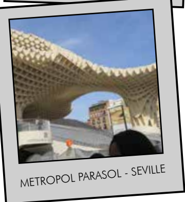
METROPOL PARASOL - SEVILLE