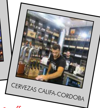
CERVEZAS CALIFA- CORDOBA