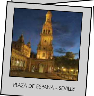
PLAZA DE ESPANA - SEVILLE