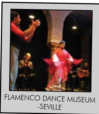
FLAMENCO DANCE MUSEUM -SEVILLE